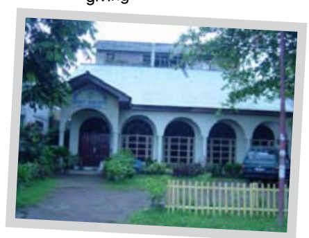
Kotamobagu GAA Church