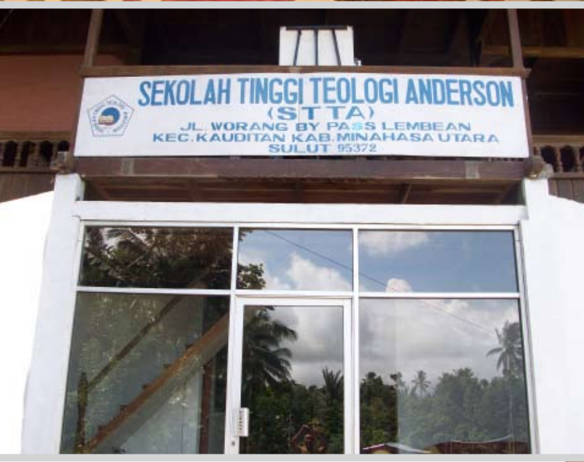
Year VI for Indonesia's GAA Seminary

participants in the Manado work in the 70's. Recently 3,750 sq. meters more were added and the present construction plans began for three more classrooms along with men's/women's dorms. Two faculty families are ready to move into the area for the 2010/11 school year which also commemorates STTAM VI and the 22<sup>nd</sup> Anniversary in August. Transfer costs of $3000 will enable these families to transfer from Jakarta to Lembean to help with teaching needs at the new building.