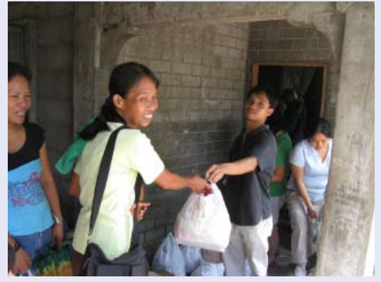
Food for the hungry