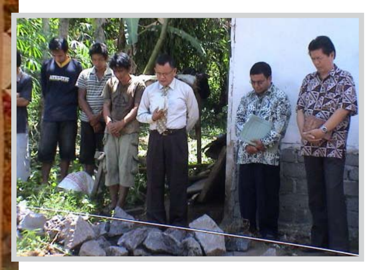
Dedication Ceremony at new seminary location

STTAM Lembean came about when 6000 sq. meters of land were donated by the Lumintangs, medical doctors, who were both original youth