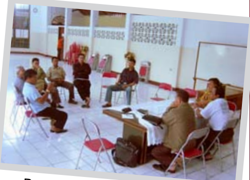
Regional board meeting in Manado