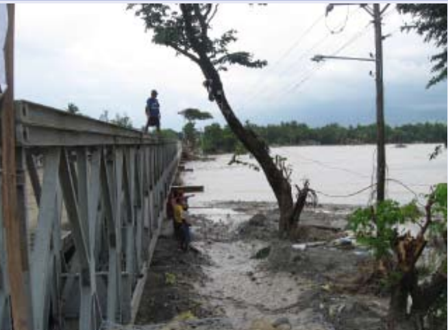
Bridge damaged by typhoons

ndoy and Pepeng, two disastrous typhoons, slammed into Central and Northern Luzon last September. A million pesos worth of properties owned by members was lost as a result of typhoon Ondoy. Even before Ondoy left the Philippines, Pepeng entered pouring rain, gusting winds up to 175 kilometers per hour. The floods in Laoag City and Tuguegarao forced members to evacuate. Pastor Simangan's house blew up. Both Bible schools incurred damage.